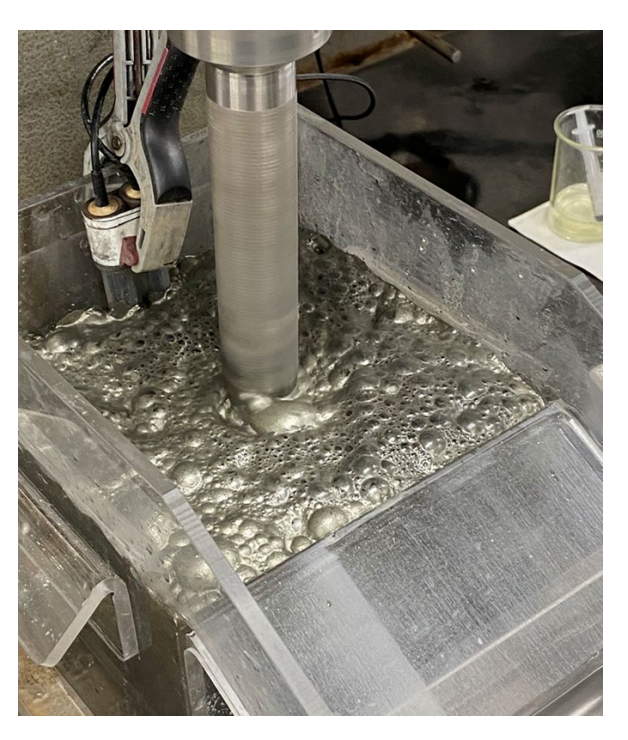
Figure 1: Jaguar Rougher Nickel Concentrate

Flotation testing of core has initially focused on the Jaguar South mineralised zone (JAG001). A composite of this zone has been developed containing a head grade of 1.63% Ni and this composite has been tested using a traditional nickel flowsheet (as used by nickel sulphide mines in Western Australia) as well as traditional reagents and process conditions for nickel flotation circuits.