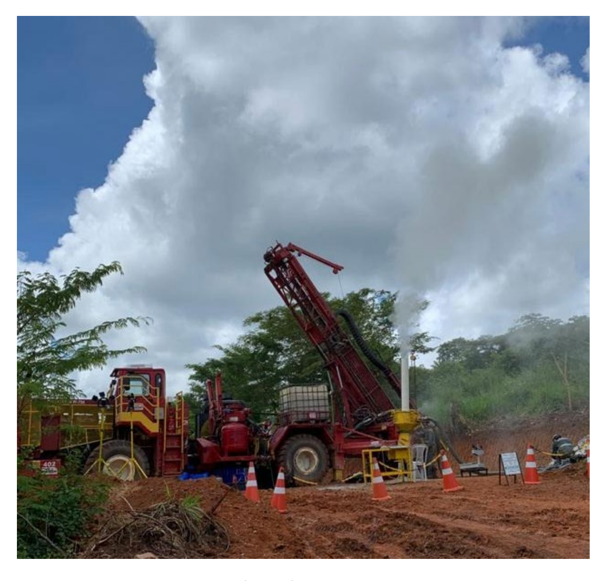
Figure 1 – Geosedna RC rig drilling first hole at the Leão Prospect

"We have already identified 10 high-priority greenfields nickel sulphide and PGE targets and we are very much looking forward to testing these in the weeks and months ahead."