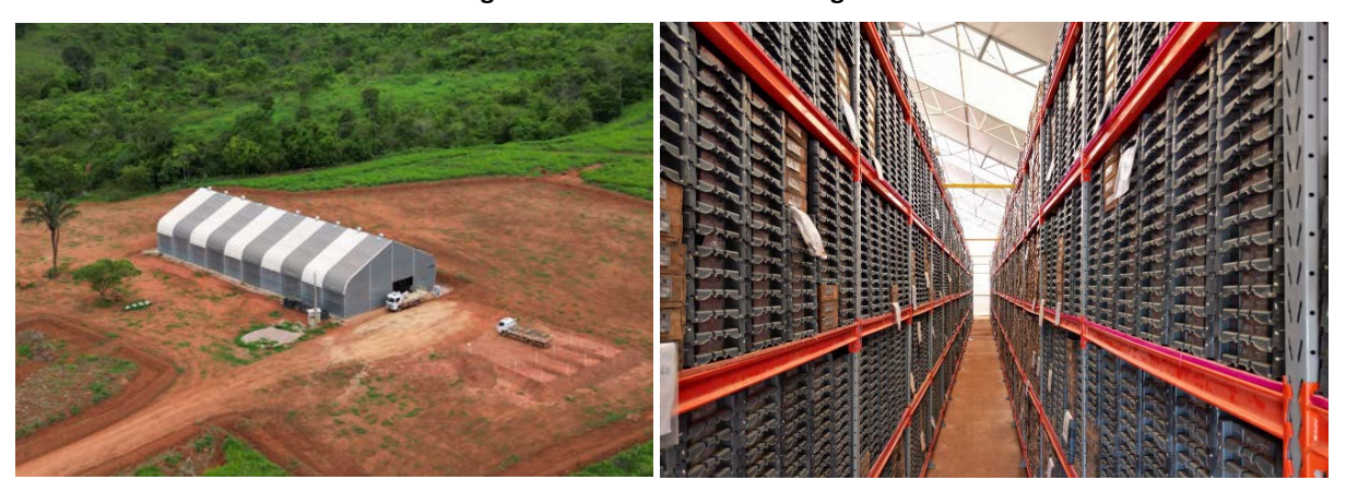
Figure 2 – New Core Shed at Jaguar

The Company has now completed relocation of all diamond drill core to the new Core Storage Shed (Figure 2) located on site near the Tres Marias exploration camp.