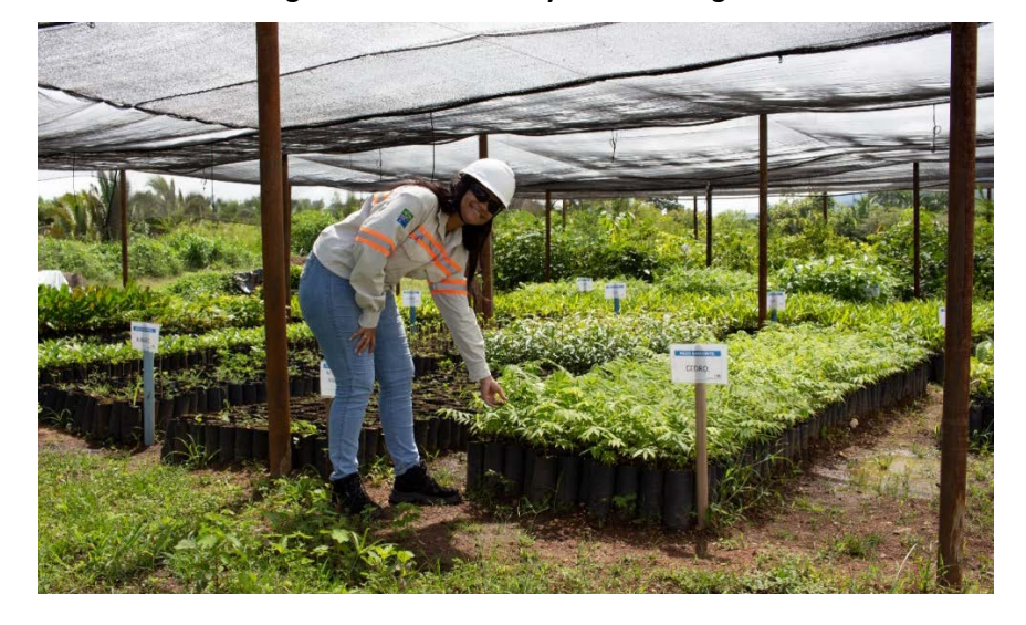
Figure 3 - Plant Nursery on Site at Jaguar

During the period, the Company planted over 5,000 native species seedlings (Figure 3) for the revegetation program of previously cleared farmland. The planned revegetation will allow new forest corridors to be established around the site to assist with the movement, protection and biodiversity of flora and fauna.