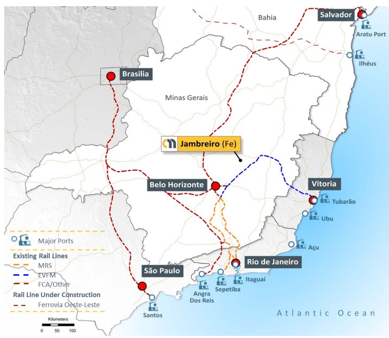
Figure 2: Export Port and Rail Logistics in South-East Brazil