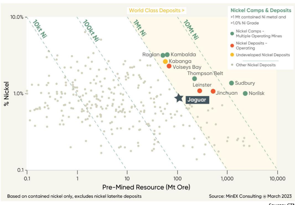
Figure 3: Comparison of nickel sulphide ore bodies.