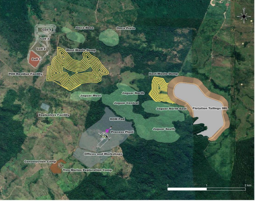
Figure 2: Overview map of planned Jaguar infrastructure.