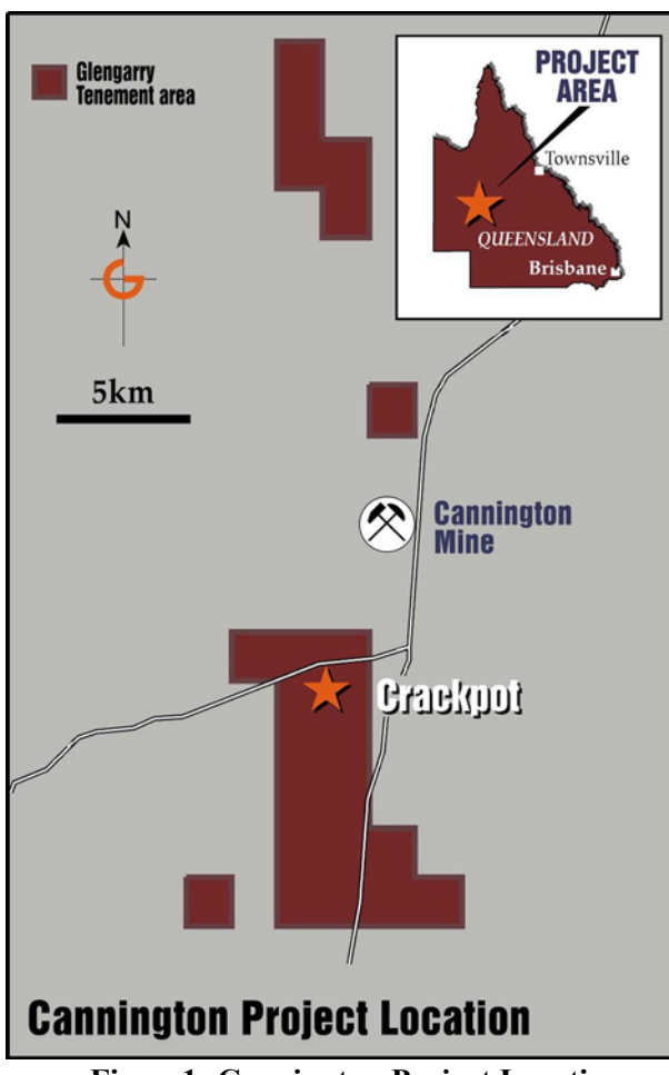
Figure1: Cannington Project Location