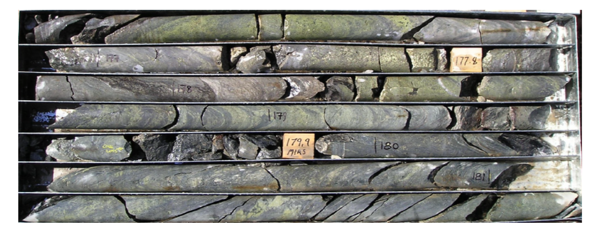
Figure 2: Photograph of diamond core from hole MTD 2 showing semi-massive chalcopyrite mineralization at top of figure.