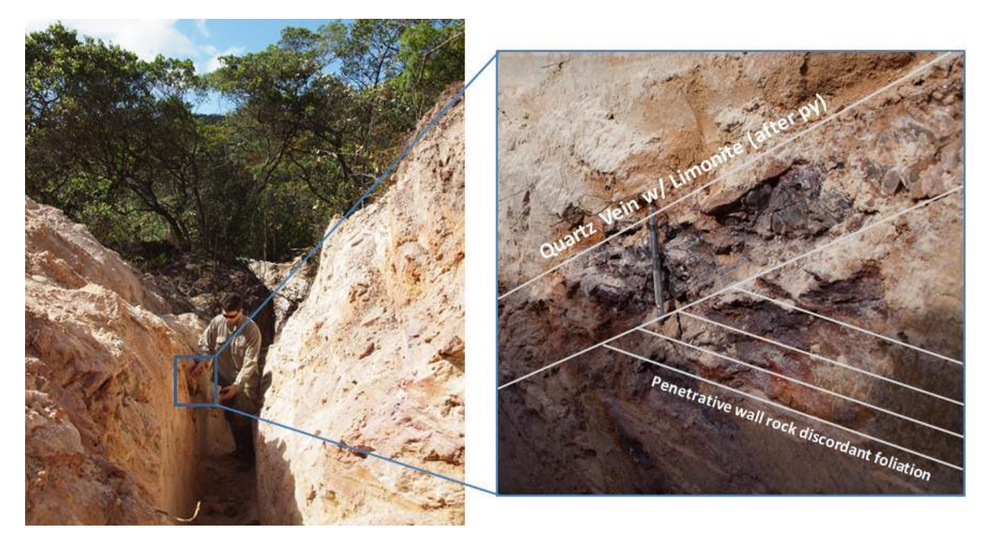
Figure 2: Detail of Mineralised Quartz Vein at MBC-TR-15-002 – Mombuca Gold Project

The best results were taken from sulphide-rich quartz veins within the intense sericite altered quartzite and included results of 3.07g/t Au and 2.11g/t Au over 0.5m intervals. A complete list with sample locations and assay results is shown in Table 3. At a contact between the quartzite and talc-chlorite schist a mineralised quartz vein was also identified with 0.88g/t Au over 0.5m.